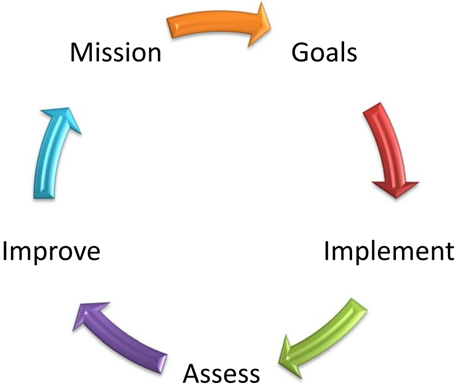
Figure 1: WCC's Institutional Effectiveness Model