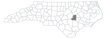
WAYNE COUNTY, NC

The Business Administration program 1 was established in 1964. In FY 2019-20, WCC enrolled 264 students in the program. Of these students, 51 graduated with a certificate and 23 graduated with an associate degree in FY 2019-20.